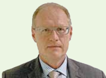
Robert Rusiecki Consul General Consulate General of the Republic of Poland in Houston

3040 Post Oak Blvd., Suite 525 Houston TX, 77056, USA Phone: +1 (713) 479 6770 Fax: +1 (713) 993 9685