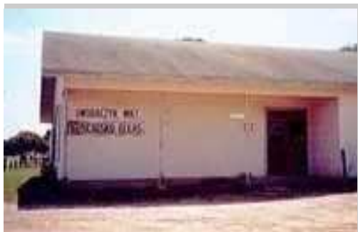
Dworaczyk's Meat Market (next door to the church). The majority of Kosciusko residents use the meat market as their local butcher" - David Scheffler, 11-26-05.

The post office only operated from 1906 to 1920 when Stockdale took over the responsibility. There were only 10 people reported in Kosciusko for the 1930 census and only 50 in 1965.