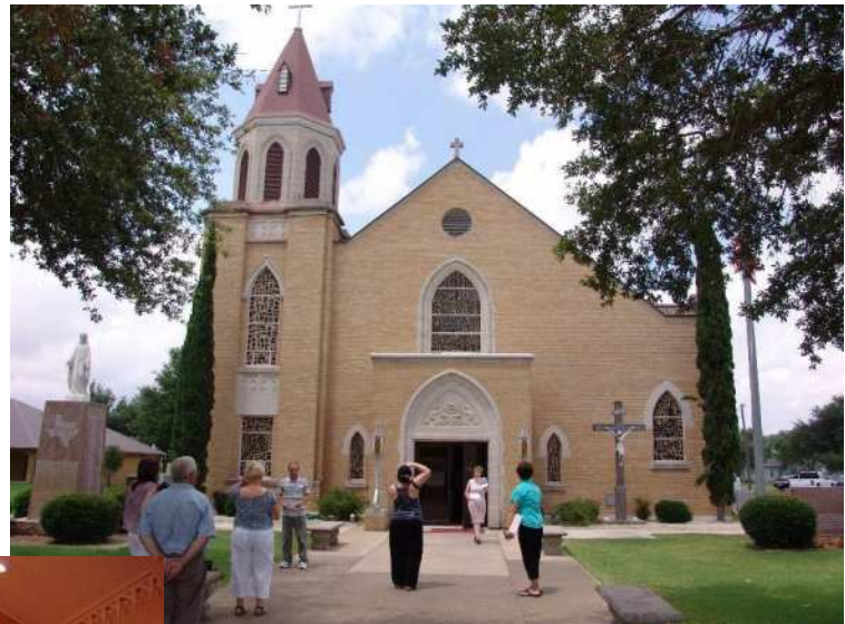
St. Ann Catholic Church, Kosciusko, Texas.