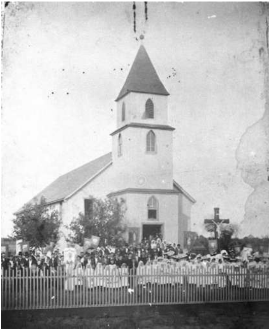
photograph w congregation in front of church St Ann Church Kosciusko Tx

Source: https://www.tshaonline.org/handbook/entries/kosciusko-tx