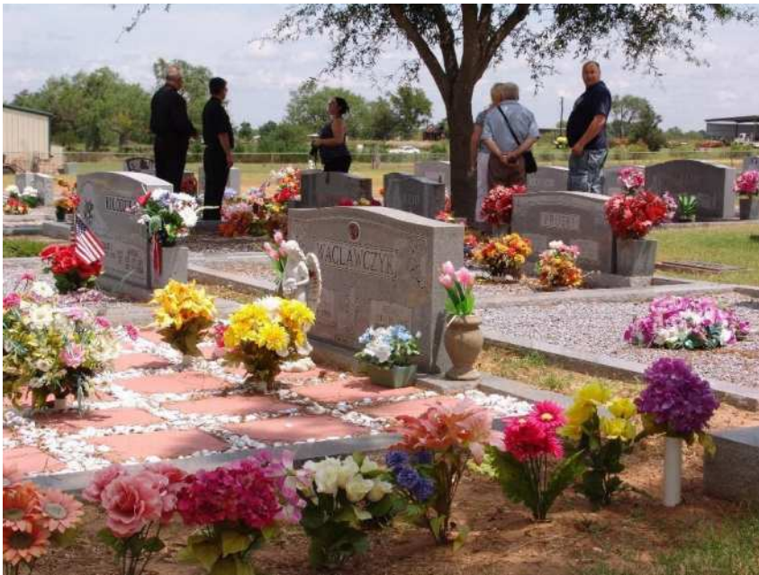
Travelers from Poland visiting the cemetery at Kosciusko, Texas. June 7, 2012.